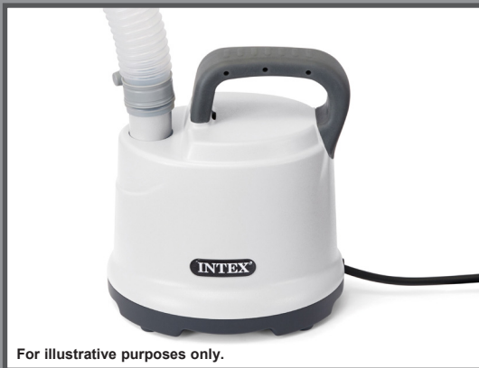
For illustrative purposes only.

POOL DRAIN PUMP Model DP30220 220 - 240V~, 50Hz, 99W Hmax 2.5 m, Hmin 0.01 m, IPX8